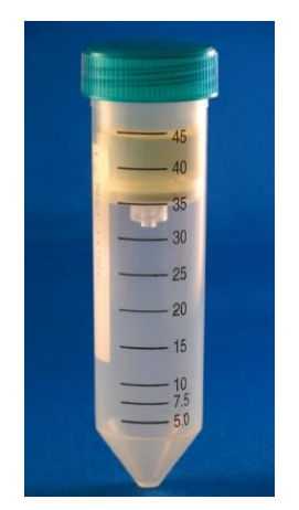
Centrifuge: Zymo-Spin™ VI Column inside a 50 ml conical tube.